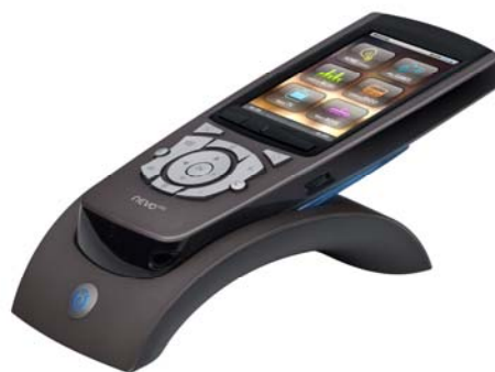
NevoS70 on Stand

Easy Access for Partners and more Powerful ‘Building Blocks’ for Retailers Gives Seamless and Efficient Home Integration